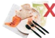
PLATES, NAPKINS, FOOD, OR PLASTIC UTENSILS