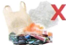
PLASTIC BAGS, FILM, OR FOOD WRAPPERS