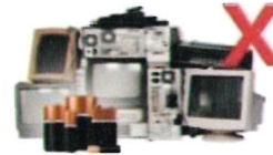
BATTERIES OR ELECTRONICS