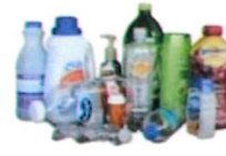
Plastic Containers Plástico